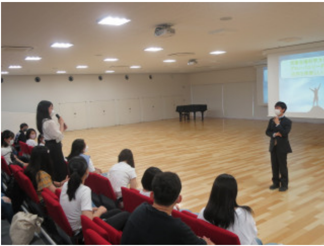
Table For Two (TFT)

For more information, please contact us at [contact information].